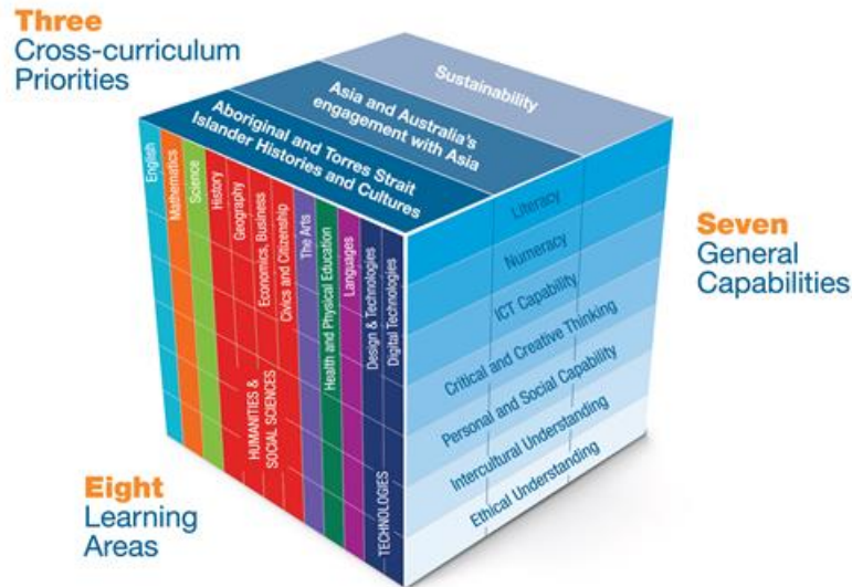
Figure 1. The three dimensions of the Australian Curriculum