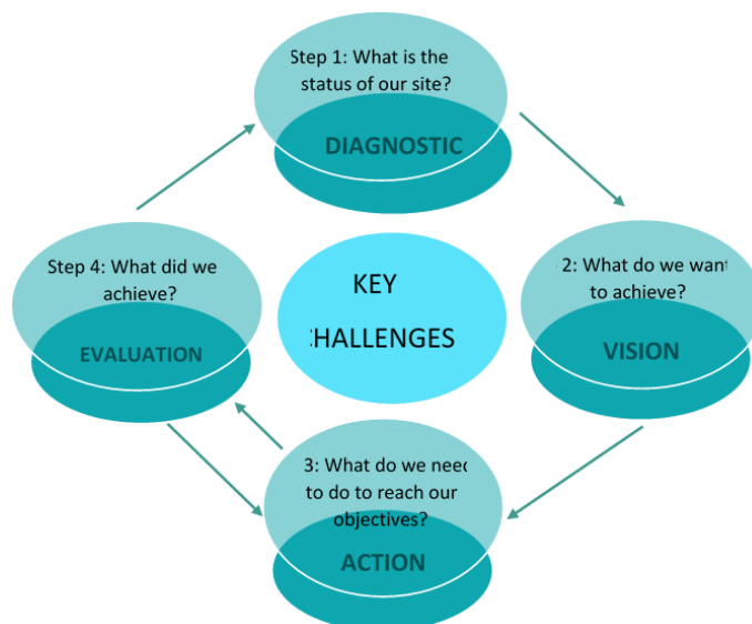
Figure 4. The 4 methodological stages of reflection on the management of an educational area.